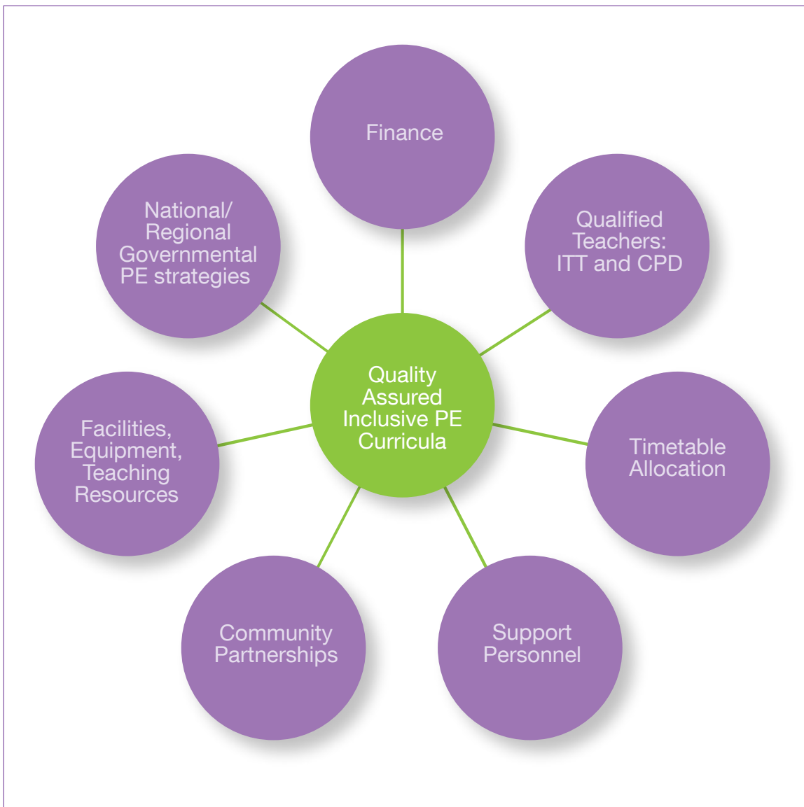
Figure 1. School Physical Education Basic Needs Model: Policy to Practice Infrastructure Template

The main findings of the Survey-generated data relevant to establishing basic needs are presented above in sections 1-7. The analysis of these findings together with analysis of qualitative information derived from items related to issues, concerns or problems as well as to specifically identified essential basic needs' requirements for inclusive quality physical education provision reported in Section 9 serve to provide an evidence-based platform for the formulation of a 'Basic Needs' Model.